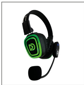
2 x Headphones Dolly Digital® type FD-Pro-M