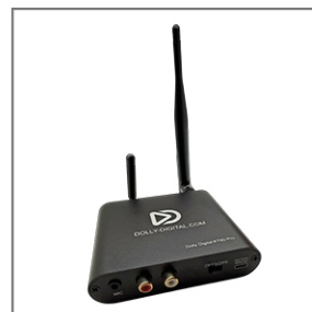
1 x Transmitter type Dolly Digital® T80Pro-Bluetooth + splitter cable