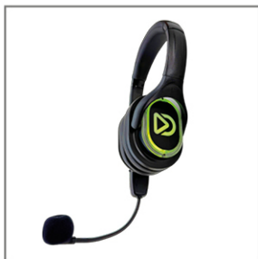
2 x Headphones Dolly Digital® type RD-Pro-M